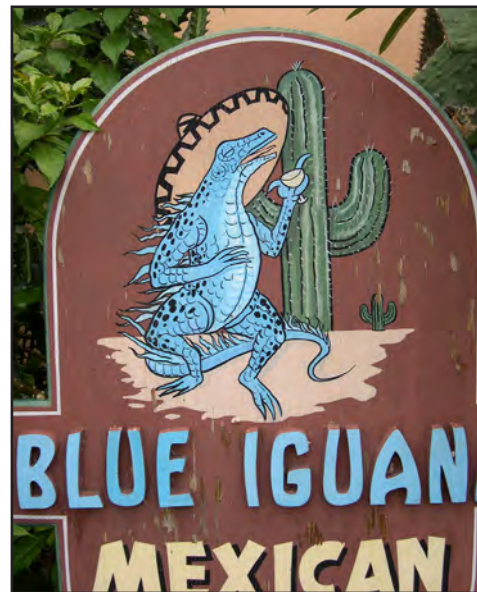
Culinary fun in Puerto Rico.

In March 2006, a team from Island Conservation (IC) and CRES (San Diego Zoo's Conservation and Research for Endangered Species) visited the Turks and Caicos Islands (TCI) to conduct a feral mammal assessment of Little Water, Water, and Pine Cays, and investigate the feasibility of eradicating cats and rats from these interconnected islands. In addition to fieldwork, meetings were held with stakeholders for these cays, including the Turks and Caicos National Trust (TCNT), the Department of Environment and Coastal Resources (DECR), the Pine Cay Home Owners Association (HOA), and a representative for the Water Cay development. IC made a second trip to the TCI in April 2006 to make a presentation to the Pine Cay HOA at their annual meeting. The Pine Cay HOA has committed $50,000 toward the eradication of cats, which is estimated to cost $155,000. IC also wrote a proposal for submission by the TCNT and DECR to the Turks and Caicos Conservation Fund for an additional $50,000 for this project, and negotiations are underway with the Water Cay developers to provide the final $50,000 needed. Feral cat eradication is expected to commence in July 2007. Eradication of rats will be much more expensive and is not currently anticipated. An electronic copy of IC's assessment is available on request.