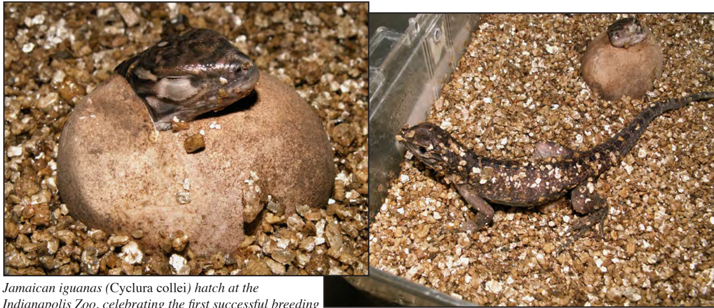
Jamaican iguanas ( Cyclura collei) hatch at the Indianapolis Zoo, celebrating the first successful breeding of this species outside of Jamaica.