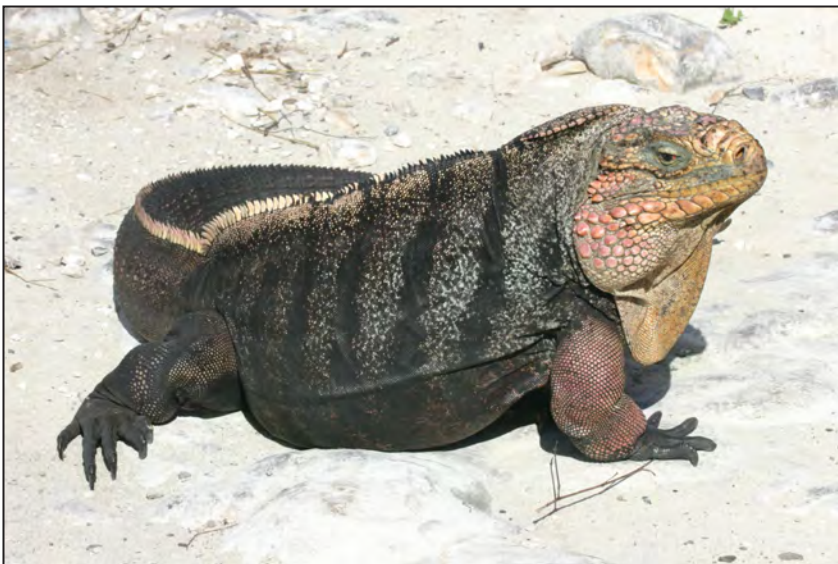
Male Cyclura c. cychlura , Tiamo Resort, Andros.

Lesser Antillean Iguana ( Iguana delicatissima ) - A 2007 study will be initiated to investigate coastal populations of I. delicatissima . Specifically, we will investigate life-history variation between disturbed and undisturbed iguana populations. Study variables will include clutch size, age to reproduction, nest-site selection, hatch rate, juvenile and adult survival, and diet. Because coastal features on many of the Lesser Antillean islands are similar, data from "control" undisturbed and disturbed sites will be used to predict the fate of populations on Dominica, and other islands where coastal development is increasing due to tourism. In addition to investigating life histories, we will radiotrack hatchlings from nests to record dispersal and survival, and document significant predators between the two sites.