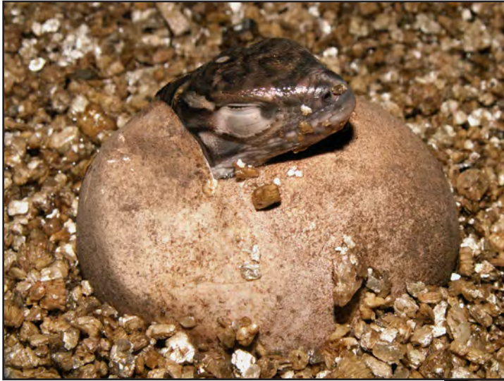
Jamaican iguanas (Cyclura collei) hatch at the Indianapolis Zoo, celebrating the first successful breeding of this species outside of Jamaica.