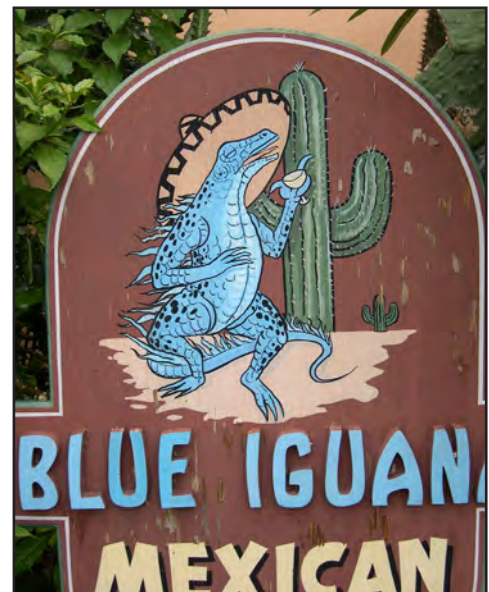
Culinary fun in Puerto Rico.

In March 2006, a team from Island Conservation (IC) and CRES (San Diego Zoo's Conservation and Research for Endangered Species) visited the Turks and Caicos Islands (TCI) to conduct a feral mammal assessment of Little Water, Water, and Pine Cays, and investigate the feasibility of eradicating cats and rats from these interconnected islands. In addition to fieldwork, meetings were held with stakeholders for these cays, including the Turks and Caicos National Trust (TCNT), the Department of Environment and Coastal Resources (DECR), the Pine Cay Home Owners Association (HOA), and a representative for the Water Cay development. IC made a second trip to the TCI in April 2006 to make a presentation to the Pine Cay HOA at their annual meeting. The Pine Cay HOA has committed $50,000 toward the eradication of cats, which is estimated to cost $155,000. IC also wrote a proposal for submission by the TCNT and DECR to the Turks and Caicos Conservation Fund for an additional $50,000 for this project, and negotiations are underway with the Water Cay developers to provide the final $50,000 needed. Feral cat eradication is expected to commence in July 2007. Eradication of rats will be much more expensive and is not currently anticipated. An electronic copy of IC's assessment is available on request.