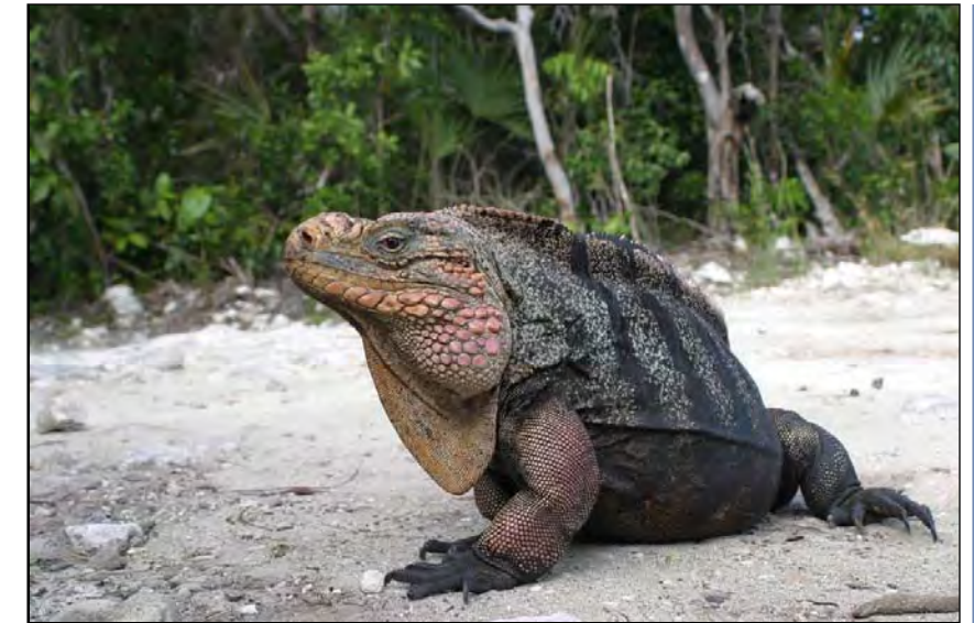
Resident male Cyclura c. cychlura at Tiamo Resort, Andros.

Booby Cay Study Complete - Cyclura carinata , a Bahamian rock iguana, currently has two recognized subspecies. Cyclura c. carinata is found on several islands and cays throughout the Turks and Caicos Islands. The second subspecies, C.c. bartschi , is now only known to exist on Booby Cay, a small island off of Mayaguana Island, Bahamas, which is also within the subspecies historic range. Support for subspecific status is weak. Geographic isolation appears to be the only strong indicator of genetic isolation. Recent conservation attempts made on the species behalf have brought questions regarding the taxonomic status of the species to the fore. We used mtDNA sequence data to ask whether there is any genetic variation that distinguishes C.c. bartschi from several sampled populations of C.c. carinata . Our findings show that the Booby Cay population of C. carinata is fixed for a common mtDNA haplotype found in Caicos Island populations of C. carinata . In contrast, four different haplotypes were found among populations designated C.c. carinata . We conclude that there is insufficient evidence to support C.c. bartschi as a subspecies and recommend that the Booby Cay population of C. carinata be included in ongoing conservation efforts currently focused on the Turks and Caicos Islands.