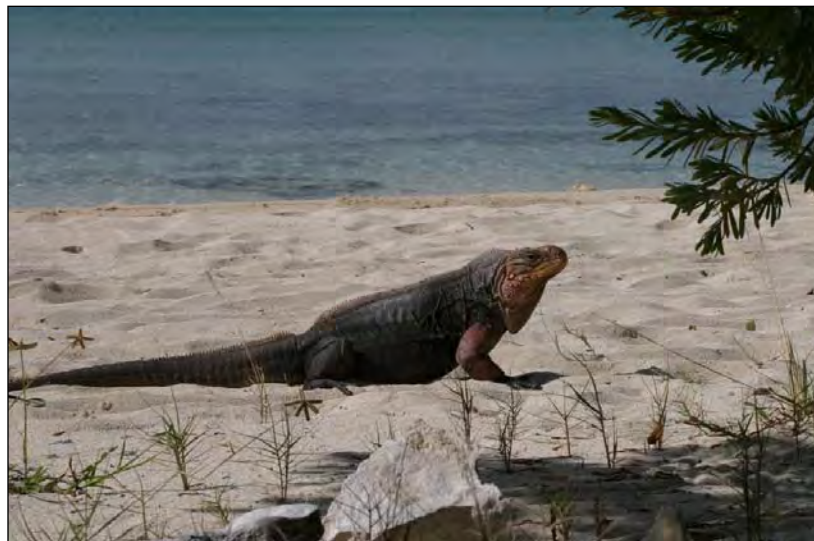
Resident male C.c.cychlura at Tiamo Resort, Andros.

The fact that adult survivorship is higher on Leaf than U Cay and yet annual population growth rate on Leaf Cay has exceeded that on U Cay seems antithetical. However, we believe this pattern is a result of higher juvenile mortality on U than Leaf Cay. Preliminary