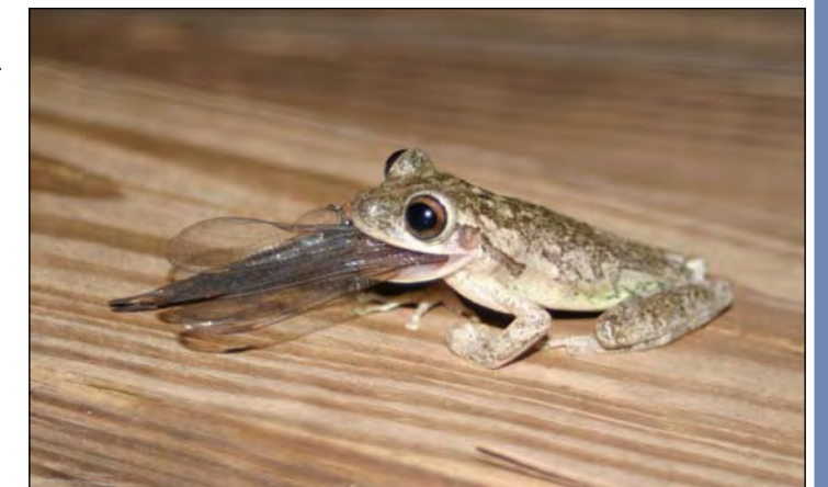
Cuban treefrog on Andros.

The Exuma Island iguana occurs on only seven cays in the archipelago and their population does not exceed 1500 individuals. Protection offered in the form of isolation is being eroded as more yachtsmen cruise the Exumas and islands are leased. Humans bring with them their dogs, cats, and unwittingly deleterious behavior of feeding the lizards. I have become increasingly concerned for the Exuma iguanas over the last two years because of elevated human activity on the cays they inhabit. More protection in the form of signs with rules should be offered to the few populations remaining throughout the Exumas.