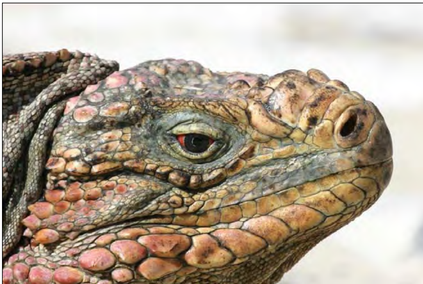
Male Cychlura c. cychlura , Andros .

Mesoamerica has been defined as one of the earth's biodiversity hotspots. The Ctenosaura group exemplifies this pattern because it is an incredibly species rich clade, however, it has received little attention thus far in scientific research. In order to evaluate plausible explanations for speciation within this clade I plan to: 1.) construct a molecular phylogeny of the iguanas of Ctenosaura melanosterna complex inhabiting the Caribbean borders and islands of Honduras, the heart of Mesoamerica, (using the C. quinquecarinata complex as an outgroup); 2.) investigate the colonization of C. bakeri , C. similis , C. melanosterna , and C. oedirhina to the Bay Islands, Cayos Cochinos and various islets in the Caribbean Sea bordering Honduras; and 3.) document the degree and directions of hybridization, between the endemic C. bakeri and a wide ranging congener C. similis , on the island of Utila, Bay Islands, Honduras. This study will provide insight into diversity, species status, and the conservation and management strategies that are necessary to preserve the Ctenosaura melanosterna complex.