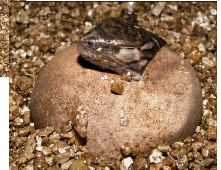
For Press Release see: http://www.indyzoo.com/pdf/JamaicanIguanasHatched.htm

Jamaican Iguanas Hatch at Indianapolis Zoo ✨ The first successful hatching of Cyclura collei in the U.S. occurred on 29 August 2006. Indianapolis is one of six zoos housing Jamaican iguanas since the 1990s. Captive reproduction has occurred only twice before at the Hope Zoo in Jamaica in 2001 and 2004 when hatchlings were discovered in a headstarting cage. Two more eggs from this female's clutch, as well as several eggs from the zoo's second female, are still incubating. Congratulations, Indy!