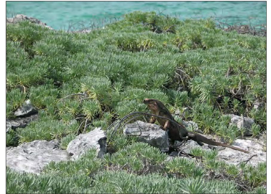
Female Cyclura cychlura inornata .

Results of DNA analyses from collected blood and future survey work should help clarify relationships among these island-separated populations. In the meantime, preliminary nesting results from FRRC verify that populations can establish quickly given appropriate nesting habitat. In addition, the island with five iguanas offers a potential experimental site to study the demographic effects of adding nesting soils to an